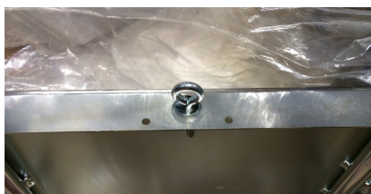
A pin keeps the bin attached to the trolley